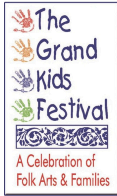
SAMPLE BANNER DESIGN